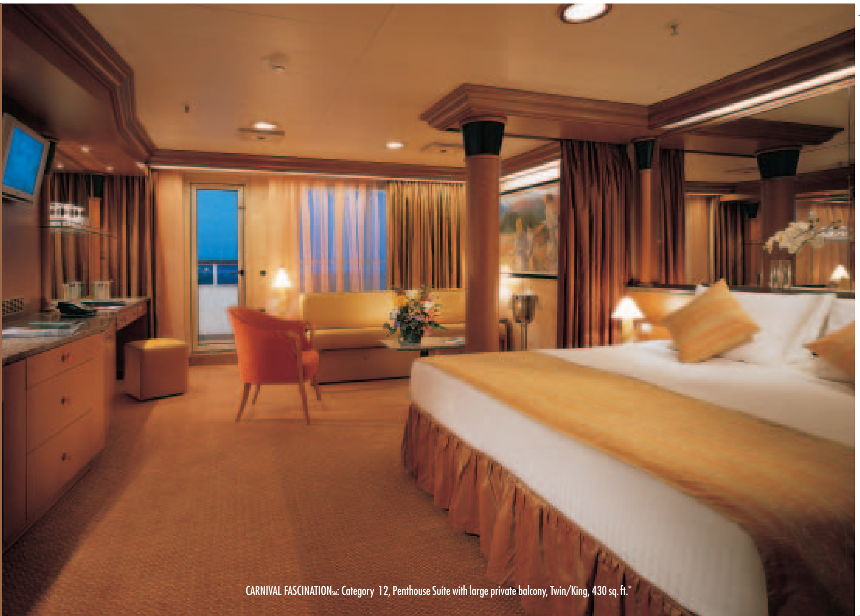
CARNIVAL FASCINATION SM : Category 12, Penthouse Suite with large private balcony, Twin/King, 430 sq. ft. *