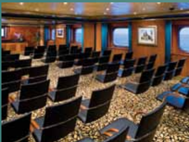
Barcelona Meeting Room

Experience the wonders of Freestyle Cruising®, as well as getting to work, aboard Norwegian Pearl. Her chic bowling alley, rock climbing wall, 17 delicious dining options, 13 bars and lounges, casino, spa, pools, fitness center, 3-bedroom Garden Villas and so much more make this Jewel Class ship a destination of her own.